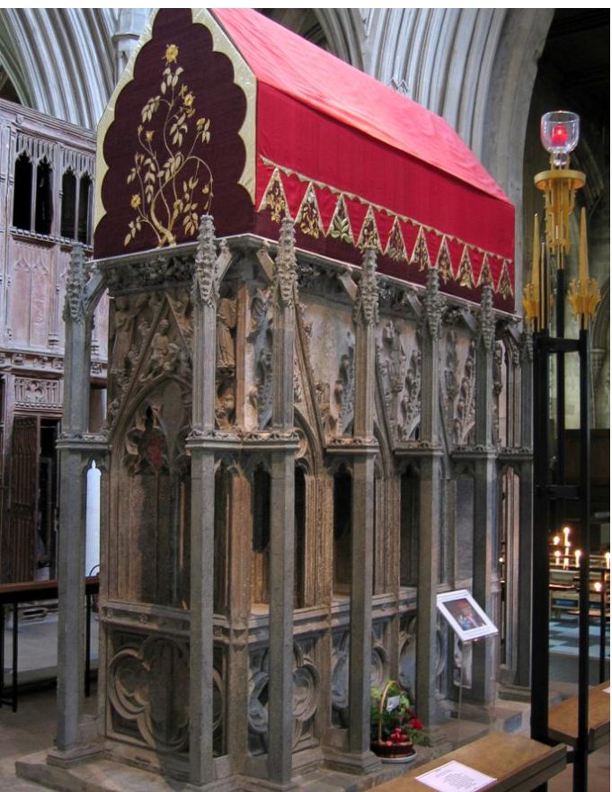
Above :Shrine of Saint Alban in St Alban's Cathedral in England; site where St. Alban is believed to have been beheaded .