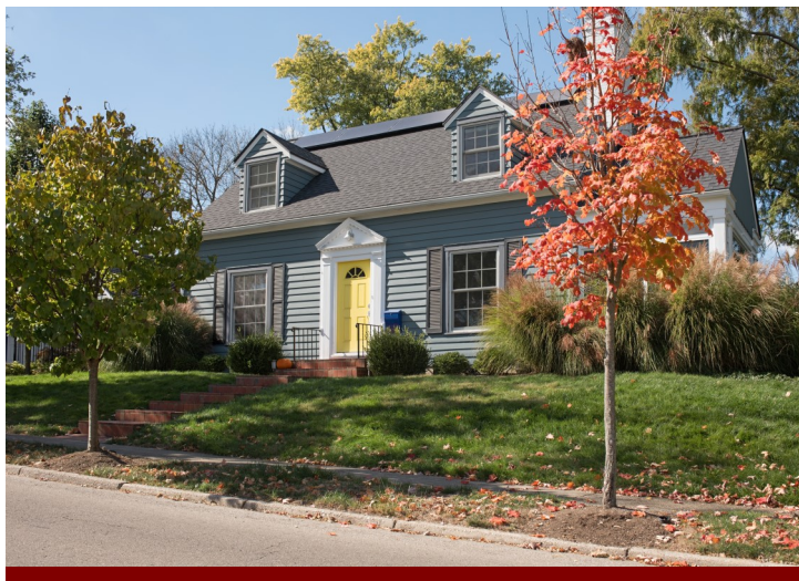
Hide or remove items that might tempt a burglar. Tools, televisions and stereo equipment are sources of quick cash for thieves. Make the rectory as unenticing to burglars as possible—especially if the rectory is off campus in a neighborhood.

Trees or other plants that come into contact with all sides of the