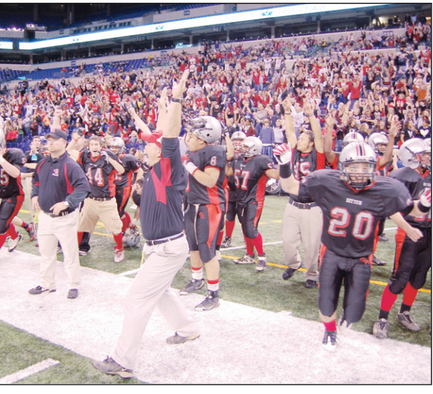
Cardinal Ritter's sideline and crowd explode with joy during the team's 34-27 win.