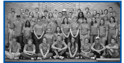
(left) Students prepare for Halloween activities (right) Forty-eight students attended this year's leadership program