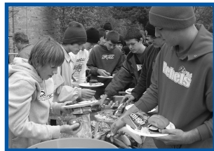
(left) "The mountain of mulch continues to grow smaller thanks to 34 Roncalli football players" (right) After four hours of hard work...time to eat!