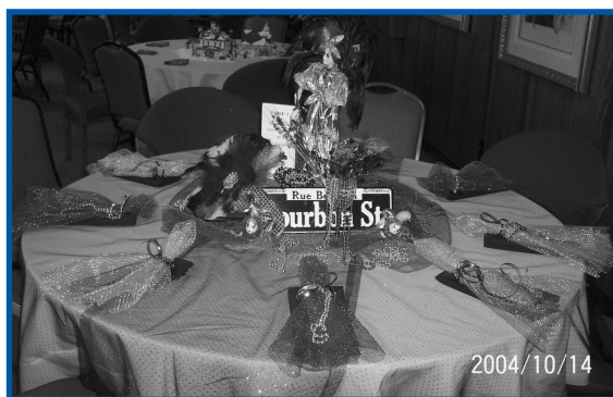
Just one of the many beautifully decorated tables at the High Tea