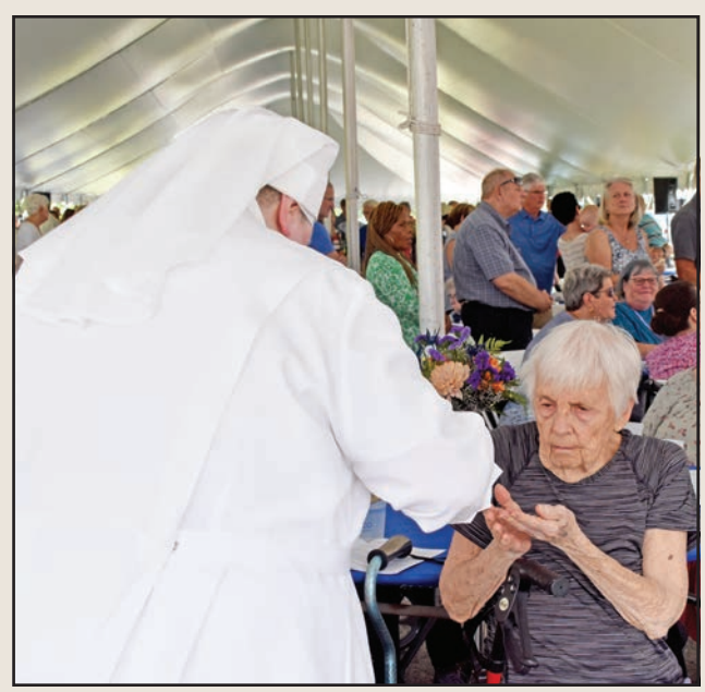
A resident of the St. Augustine Home receives the Eucharist from a Little Sister of the Poor during a Mass on the grounds of the home in Indianapolis on Aug. 26.

Through fundraising, land was purchased on the corner of West 86th Street and Township Line Road on the city's northwest side, and construction began on the current home. The sisters and the residents moved there in November 1967.