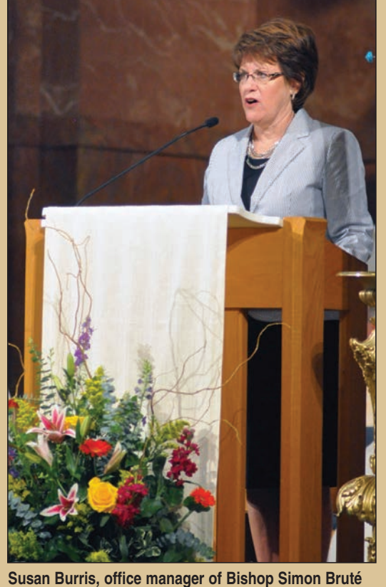
College Seminary in Indianapolis, proclaims the second reading at the June 7 ordination Mass. All four men ordained priests at the Mass were graduates of Bishop Bruté.