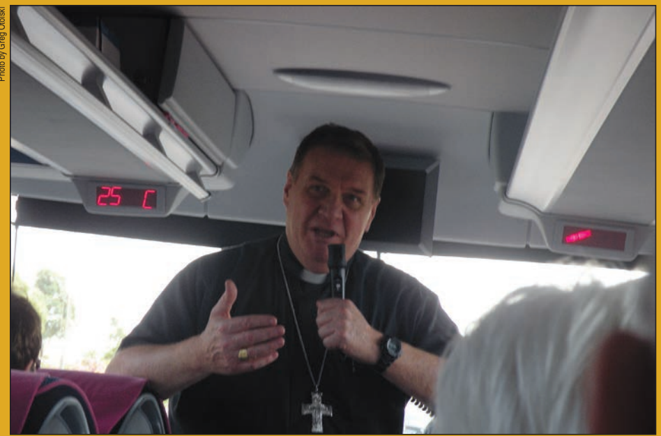
During the archdiocesan pilgrimage in Italy, Archbishop Joseph W. Tobin occasionally used the tour bus microphone to share stories and details about the country where he lived for 21 years while serving the Church.