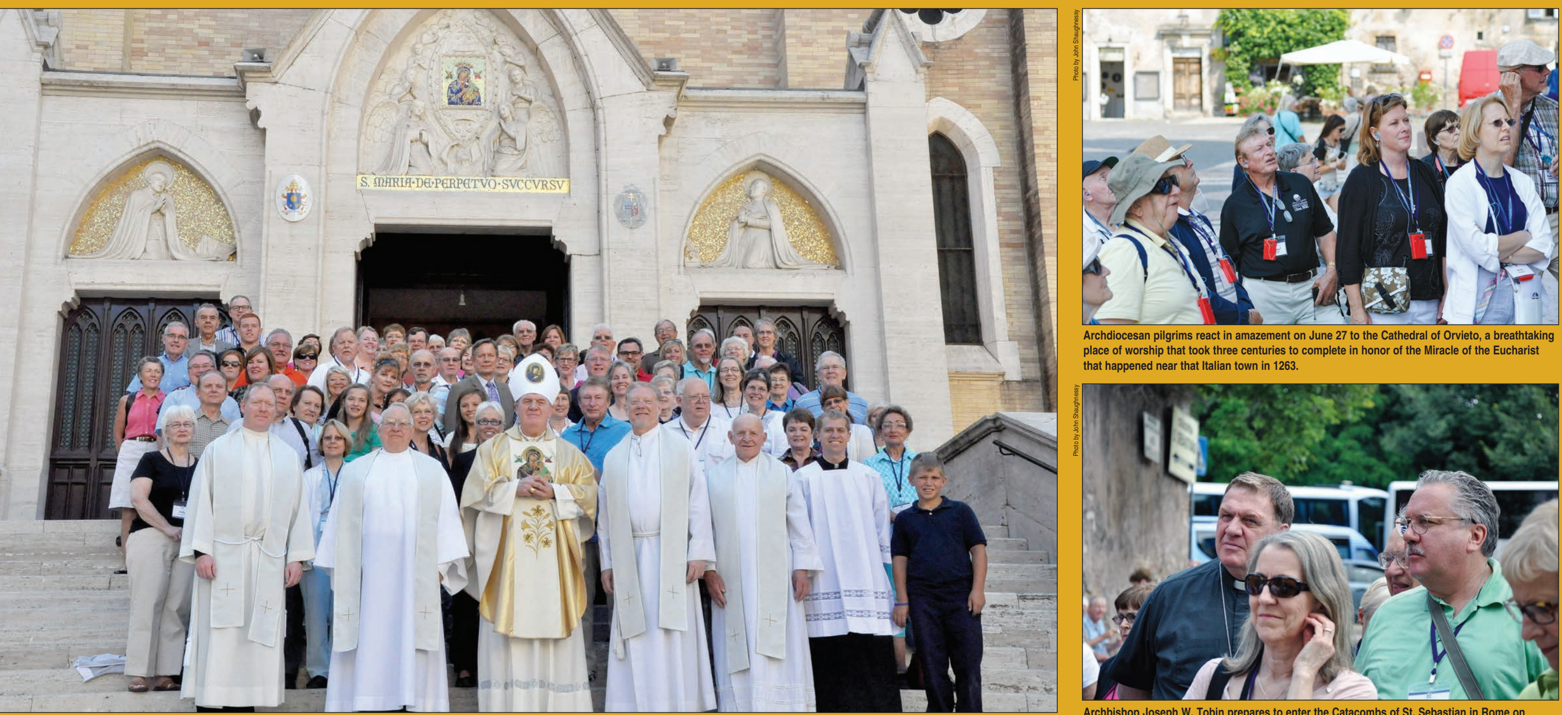
Pilgrims on the archdiocesan pilgrimage to Italy pose for a group photo on the steps of the Church of St. Alphonsus Liguori—the founder of the Redemptorist religious order which Archbishop Joseph W. Tobin previously led as its superior general—following the pilgrims' farewell Mass in Rome on July 1.