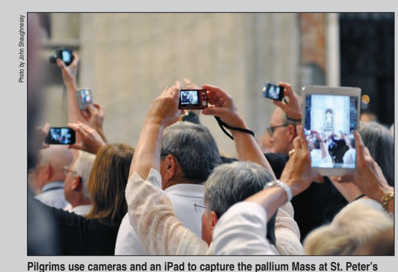
Basilica at the Vatican on June 29.