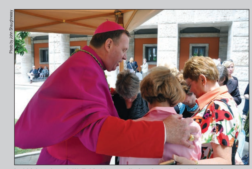
Archbishop Joseph W. Tobin blesses pilgrims from the Archdiocese of Indianapolis during a reception at the Pontifical North American College in Rome on June 29.