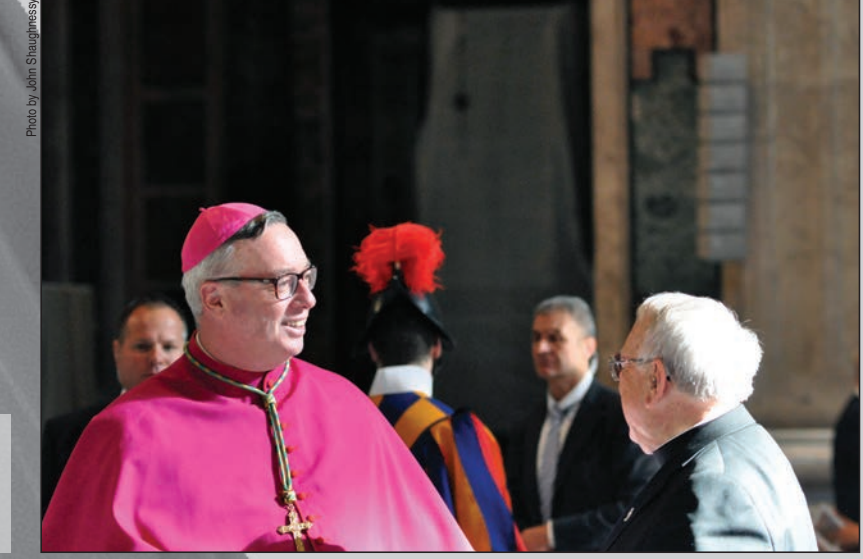
Above, longtime friend and colleague Redemptorist