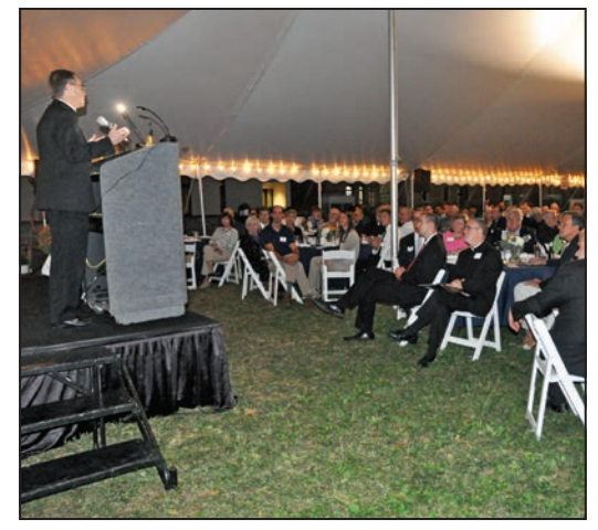
Archbishop Charles C. Thompsons speaks on Sept. 23 on the grounds of Bishop Simon Bruté College Seminary in Indianapolis to some 175 supporters of the archdiocesan-operated college seminary during its annual Celebrate Bruté event.

Building up fraternity among future priests during their time in seminary will benefit them after they enter ordained See BRUTE, page 2