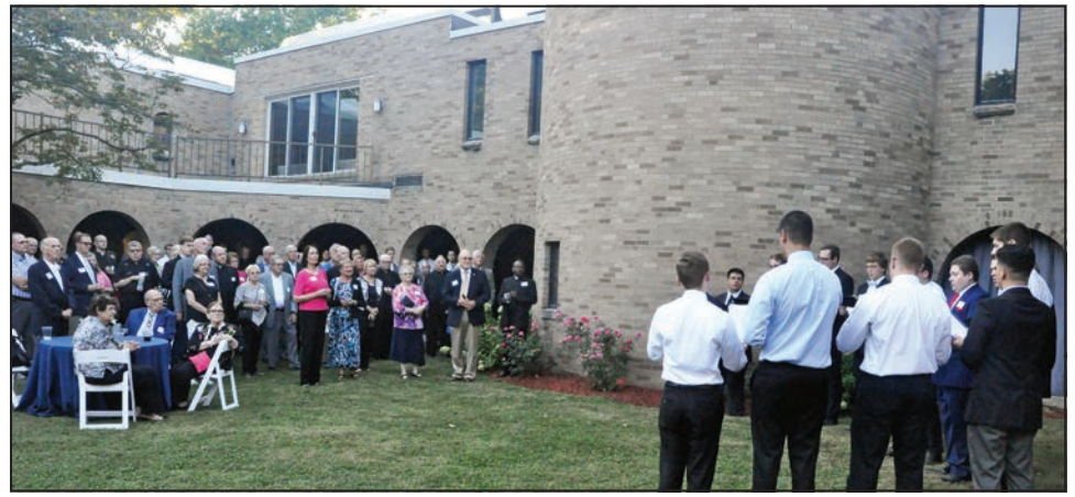
Supporters of Bishop Simon Bruté College Seminary in Indianapolis listen on Sept. 23 to the seminary's choir. The approximately 175 supporters of the archdiocesan-operated seminary were there for its annual Celebrate Bruté event.