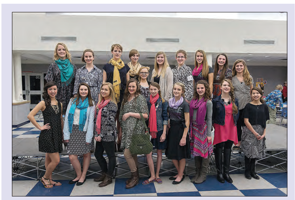
Young women from SS. Francis and Clare of Assisi Parish in Greenwood pose on Feb. 8 wearing clothes highlighted at a fashion show at the Indianapolis South Deanery faith community. Several events that day raised awareness of human trafficking. The clothes in the fashion show were designed and created by Cambodian women rescued from human trafficking. The events of the day were organized by parish leaders of pro-life, catechetical and other ministries.

"When we're at church together and we're talking about God and Jesus, there's something that comes over him that is so reverent and so from his heart," she says. "He just points to Jesus on the cross every time we're in church, and he says, 'He's the man.'