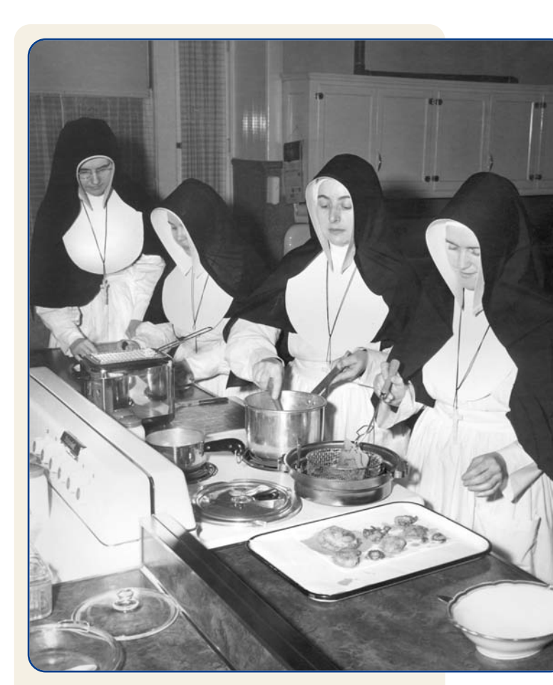
Sisters of Providence prepare a meal in a foods class during a 1950 summer session at Saint Mary-of-the-Woods College.

The first student at the academy arrived for enrollment July 4, 1841. The Sisters' reputation as outstanding educators grew, and more requests came for their assistance in founding and staffing other schools. Sisters would eventually staff schools across Indiana, and extend their ministry into Illinois, Massachusetts, California, Florida, Texas, Oklahoma and other states. The Sisters of Providence were the first women's congregation of the United States to establish a mission in China, and they formerly had missions in Peru and Antigua. Currently missions are in Taiwan, China and the Philippines.