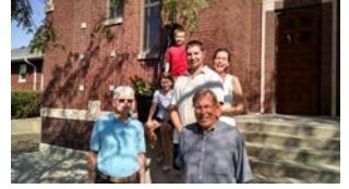
Picture: September 23, 2017 Rosary Walk.

**Due to the Thanksgiving and Christmas holidays the November and December walks have been canceled. Please mark your calendar in January to participate in the Indiana March for Life on Monday, January 22, 2018 – more information to come. Faithful Citizens Rosary walk will resume on February 24, 2018 following the 10:00 am Mass at Our Lady of the Most Holy Rosary Church, 520 Stevens St. Indianapolis.**