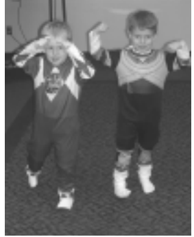
Dress up time turns these two into Power Rangers