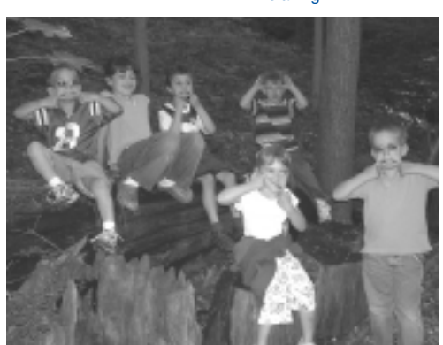
Group pauses for a goofy picture as they walk the trails