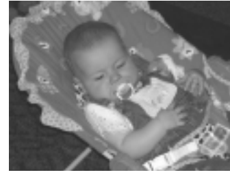
"I find our Lady of Fatima to be quite relaxing"

Cost is just $25.00 per mom. Childcare limited to 50 children. Register early!