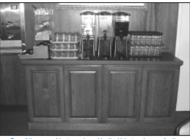
One of the new cabinets purchased by the Volunteer League for the dining room.

Other donations have purchased a new laptop and LCD projector and a new portable sound system.