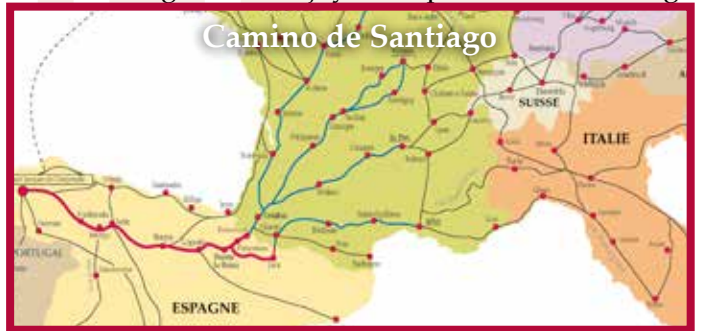
Camino de Santiago

de Compostela. Visit the impressive Cathedral which is considered to be one of the finest pieces of architecture in Europe. After Mass, climb up the stairs behind the altar to visit the crypt, where a silver urn contains the relics of St. James. See the Portico de la Gloria (Gateway to Heaven), an unparalleled masterpiece. Walk to the top of the Cathedral for a panoramic view of this glorious city. We will also visit the museum in the cloister adjoining the Cathedral. (Option: For those with the stamina you can walk the last 9 miles of the Camino on your own today taking in the pilgrimage of all those who have travelled on the Camino for centuries.)