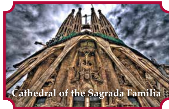
Cathedral of the Sagrada Familia

herself the "Immaculate Conception". This evening we will participate in the Blessed Sacrament Procession and the Candlelight Procession.