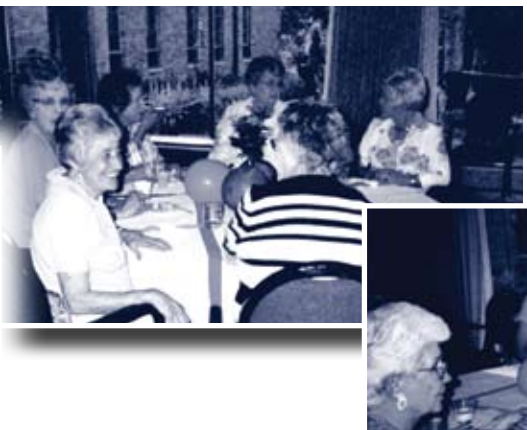
Photos from our recent Kitchen & Housekeeping 'shower'. Thanks again to all our volunteers