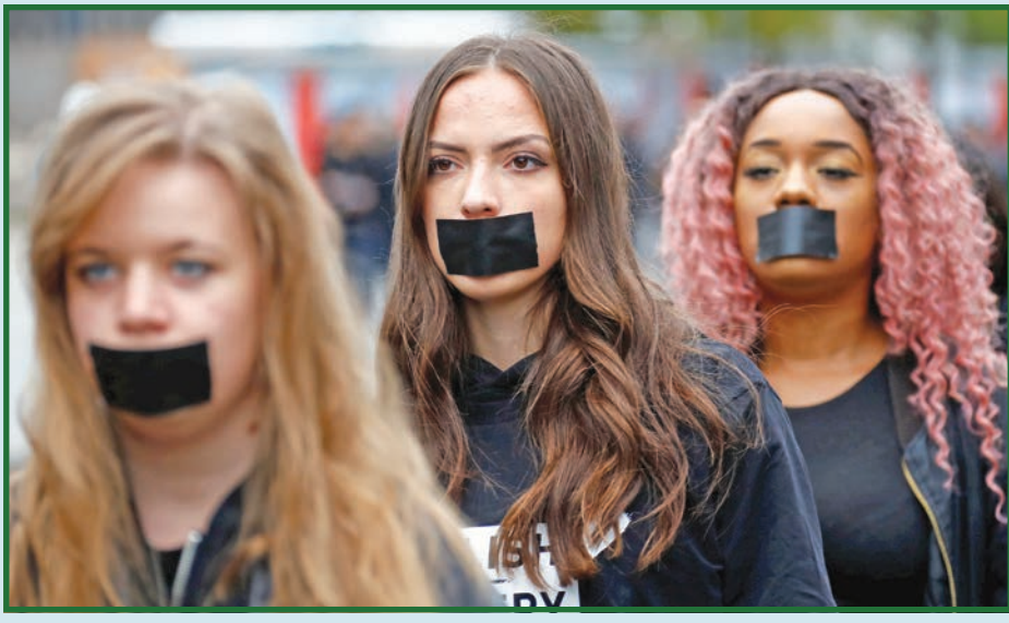
Activists in Berlin take part in a "Walk for Freedom" to protest human trafficking in 2018. Caritas Internationalis issued a statement on July 28 that said insufficient attention "was paid on the collateral damage of the ongoing pandemic, especially on migrants and informal workers, who are now more exposed to trafficking and exploitation."

Once they had the plan, they needed the approval of Archbishop