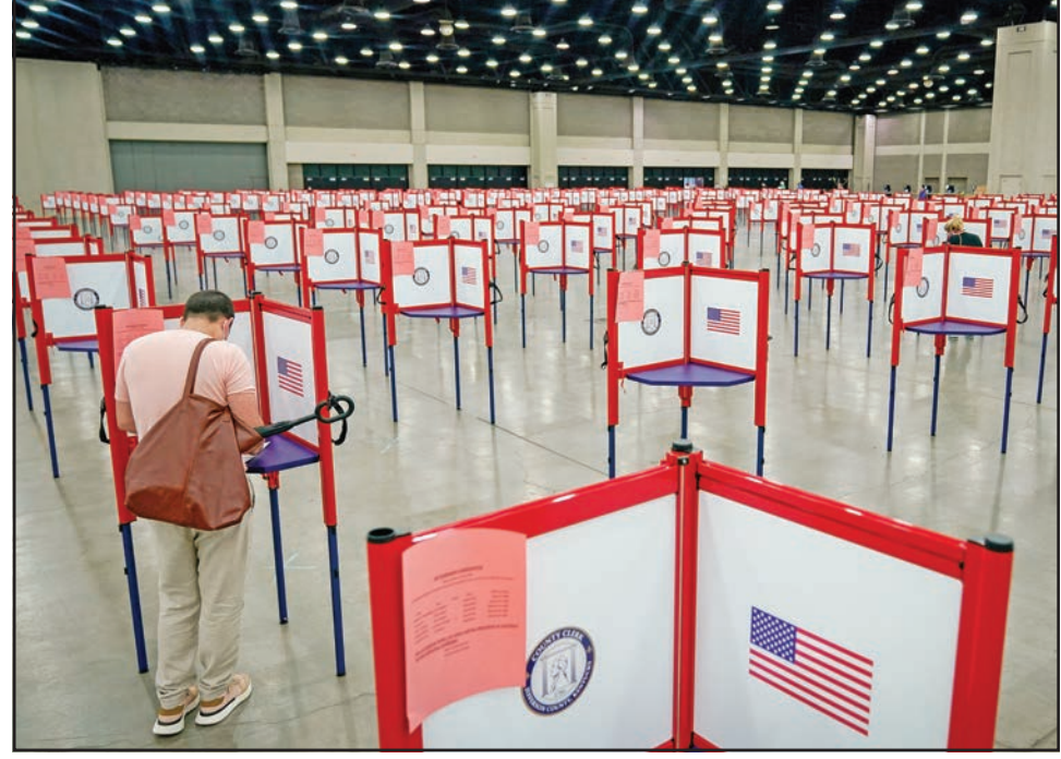
A voter in Louisville, Ky., completes his ballot on the day of the primary election on June 23. The Indiana Catholic Conference is hosting three webinars—on Oct. 5, 7 and 10—to offer Catholic voters a guide for the upcoming November elections.