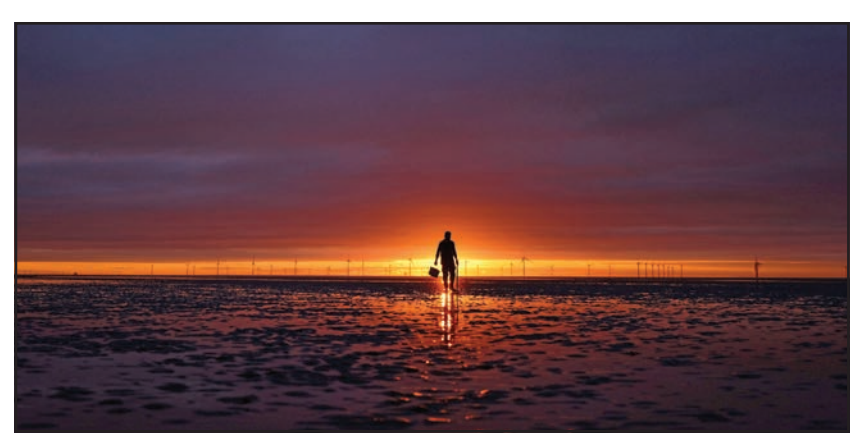
A fisherman is pictured in early August searching for bait along the beach at sunset in New Brighton, England. Pope Francis offered a special reflection for the World Day of Prayer for the Care of Creation and the beginning of the Season of Creation on Sept. 1.