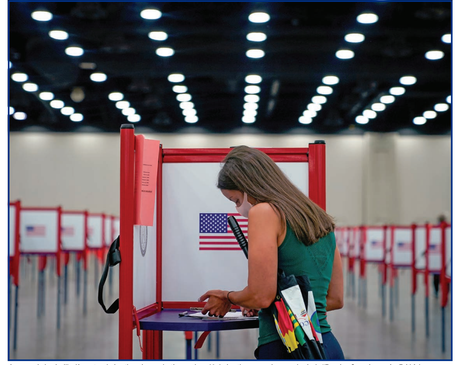
A woman in Louisville, Ky., votes during the primary election on June 23 during the coronavirus pandemic. In "Forming Consciences for Faithful Citizenship," the bishops in the U.S. offer guidance to help voters make moral choices in voting.

The first temptation, the bishops note, is to miss the ethical distinctions between different issues: "The direct and