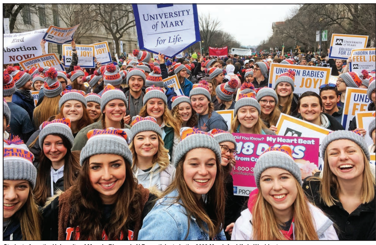
Students from the University of Mary in Bismarck, N.D., participate in the 2020 March for Life in Washington.

March for Life has taken place in Washington every January since 1974. It is always held on a date near the anniversary of the Supreme Court's 1973 rulings,