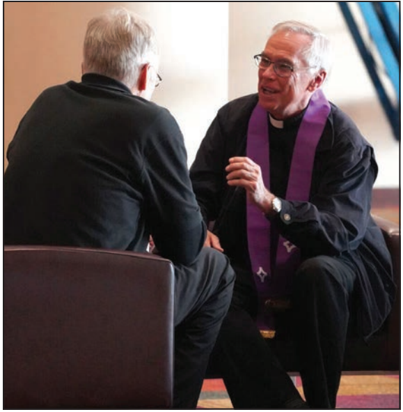
opportunity to witness to their faith in the midst of the event. Mass was celebrated

across the street from the Convention Center at St. John the Evangelist Church. Following Mass, the men participated in a public rosary and eucharistic