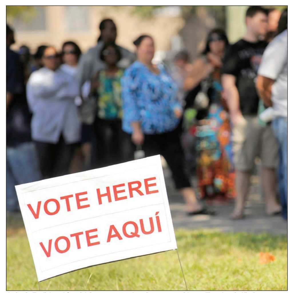
A sign in English and Spanish is seen as people wait to vote outside a polling place in Kissimmee, Fla. The U.S. bishops call in "Forming Consciences for Faithful Citizenship" to take part in elections in order to promote the common good.