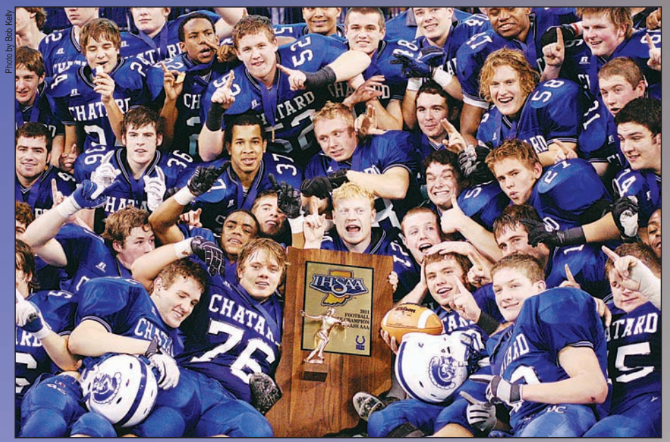
The football players from Bishop Chatard High School in Indianapolis rejoice as they celebrate the school's 11th state championship in football—a state record.