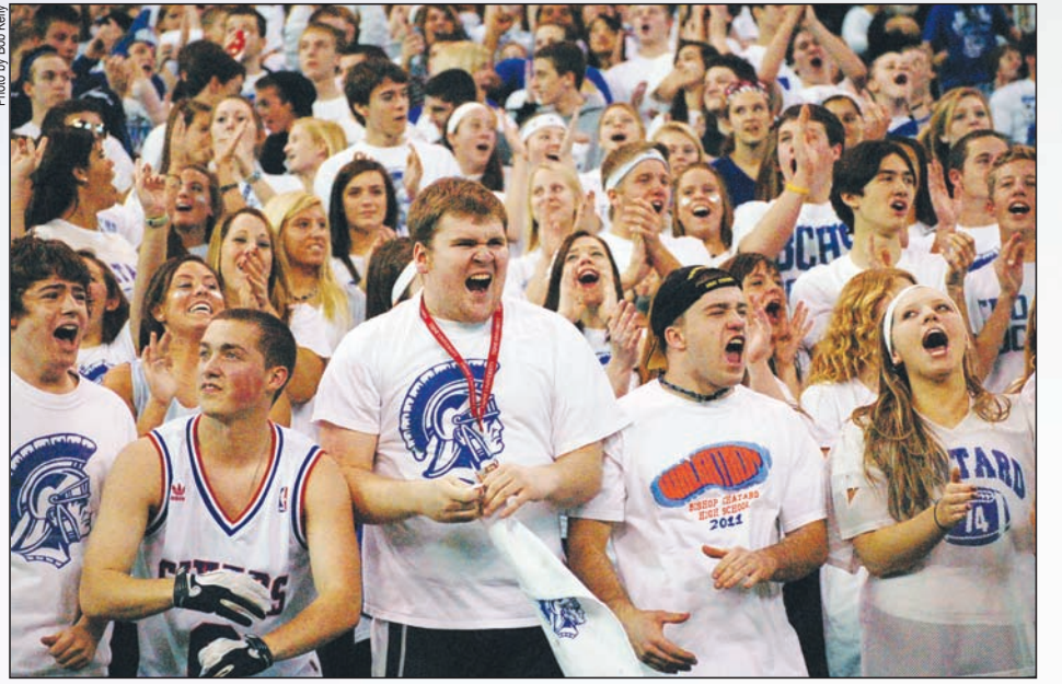
The student section from Bishop Chatard High School in Indianapolis roars its approval as its Trojans football team captures another Class 3A state championship by beating St. Joseph High School of South Bend 21-7 on Nov. 26 at Lucas Oil Stadium in Indianapolis.