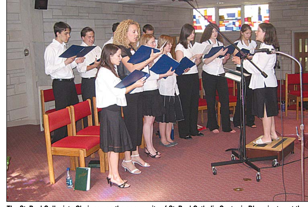
The St. Paul Collegiate Choir serves the community of St. Paul Catholic Center in Bloomington at the 5:30 p.m. Sunday liturgy through their music ministry. The group of singers is primarily made up of students from Indiana University.