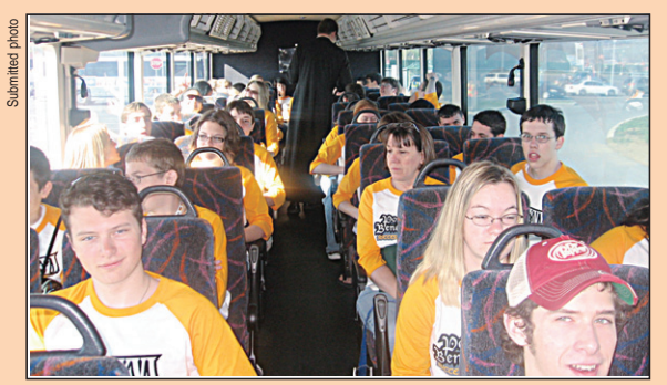
Even a long bus trip from Indianapolis to Yonkers, N.Y., couldn't diminish the enthusiasm of the 44 youths and six adult chaperones from the archdiocese who made the trip in April to see Pope Benedict XVI.