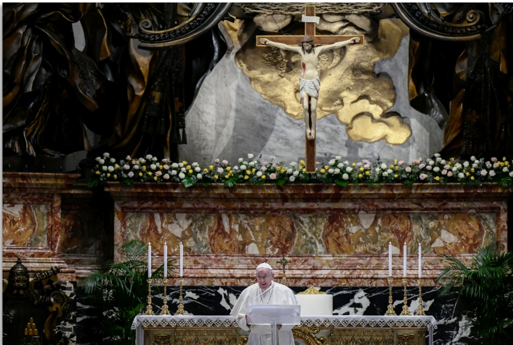
Pope Francis delivers his "urbi et orbi" Easter message after celebrating Mass in St. Peter's Basilica at the Vatican on April 4, 2021.

As we emerge from the long dark winter of this pandemic, let’s pray that the Holy Spirit will give us the courage and the strength to be the face of Jesus to those who are still suffering. Let’s see and touch him in each other—especially in those among us who are most vulnerable or in need of Christ’s healing presence.