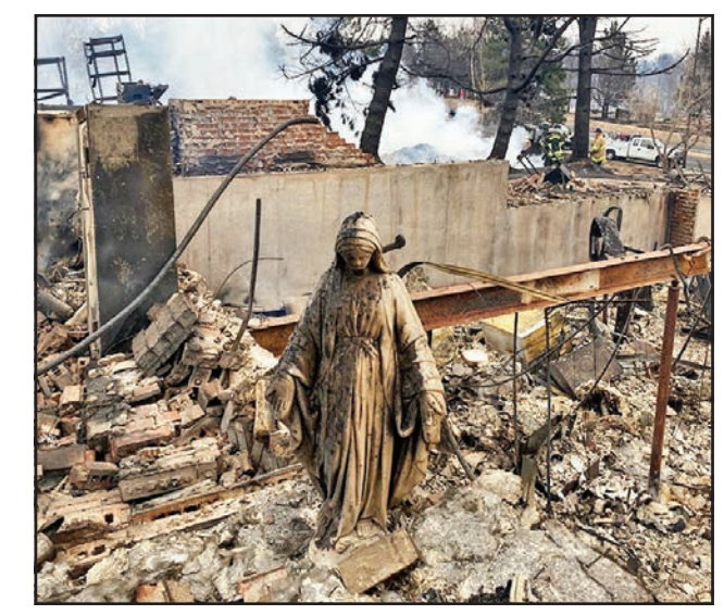
A statue of Mary is seen standing amid the rubble of a Louisville, Colo., home on Dec. 31, 2021.