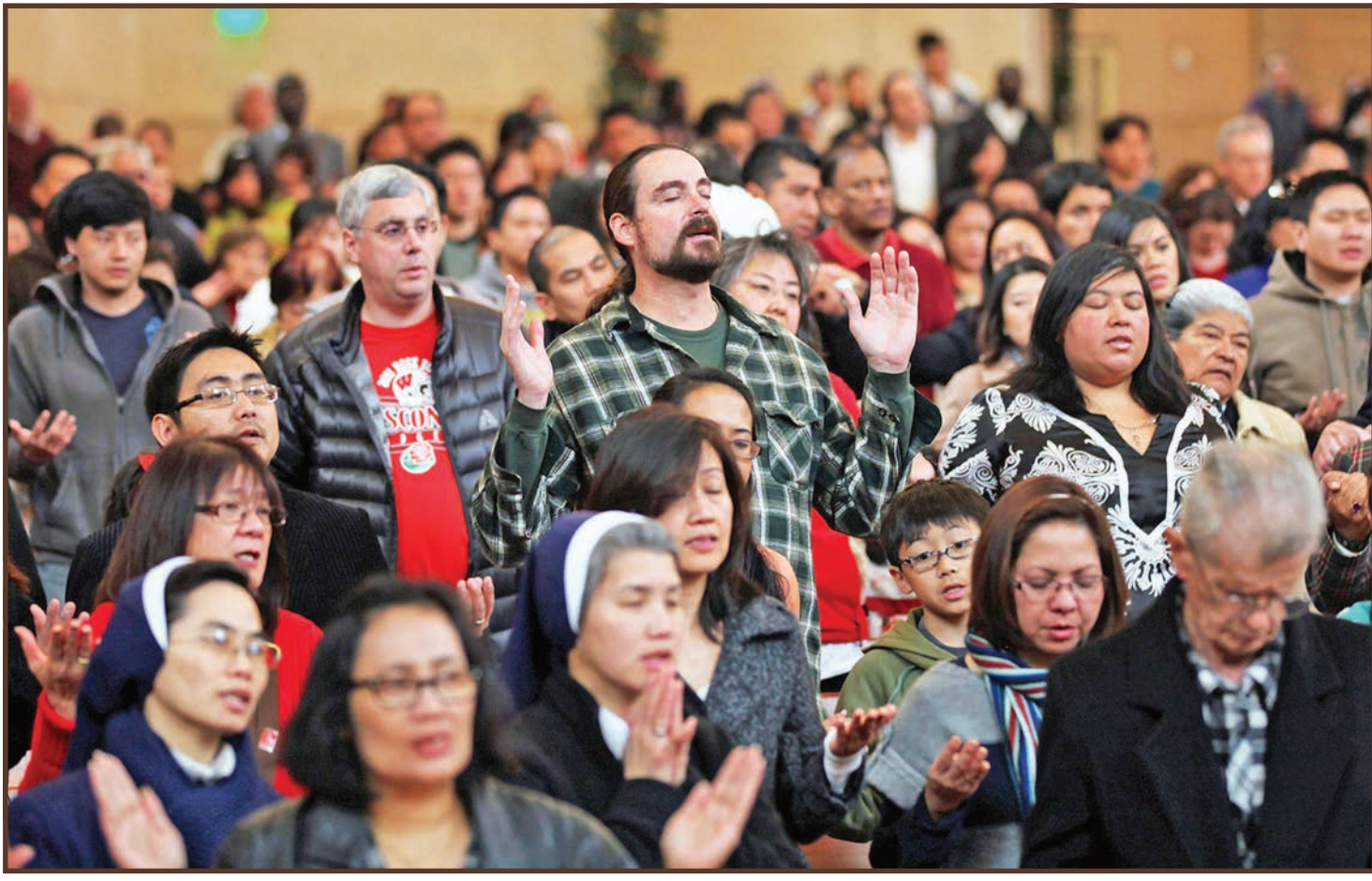
People pray during Mass on New Year's Day at Our Lady of the Angels Cathedral in Los Angeles on Jan. 1, 2011. Many people will begin the new year with many trials related to the year just completed. Even in the midst of those hardships, the kingdom of God can be built up with the help of his grace.

Some of us have become disillusioned with the outward trappings of our lives of faith. This grace-filled disillusionment has allowed us to set our sights back on the primacy of the present moment and context in which we find ourselves as the stuff of our sanctification and