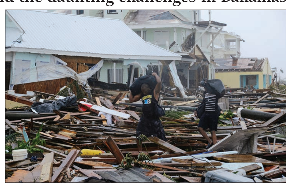
People carry their belongings through rubble on Sept. 2 in the aftermath of Hurricane Dorian in Marsh Harbour, Bahamas.