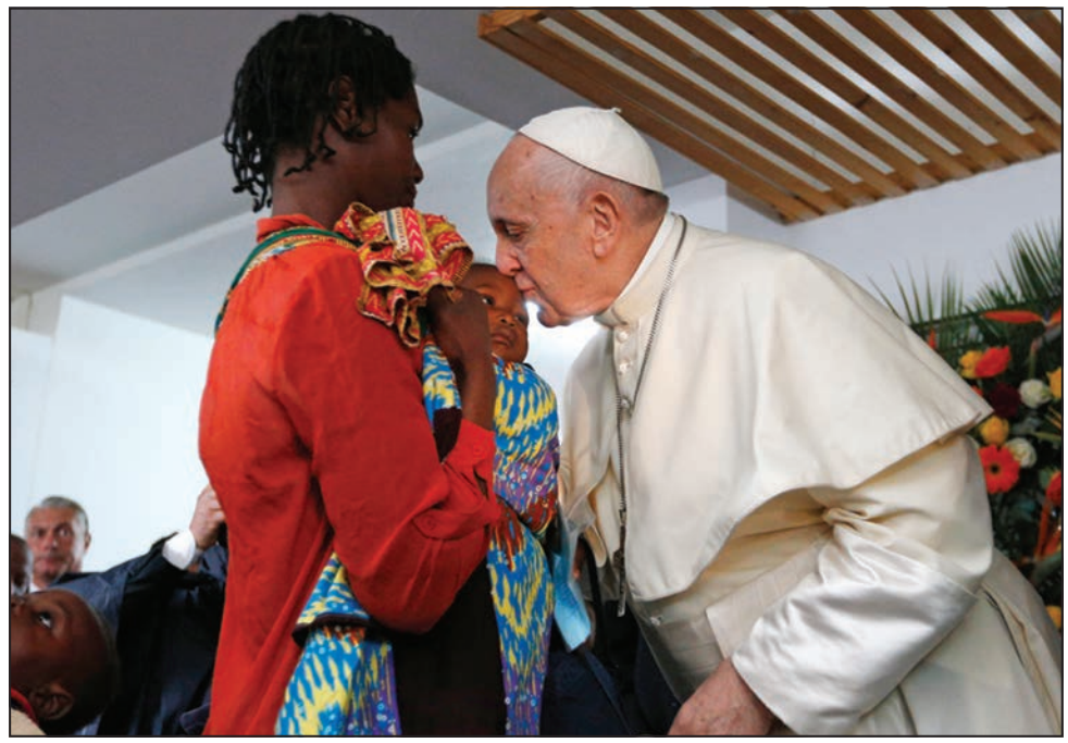
Pope Francis kisses a baby as he visits the Zimpeto Hospital outside Maputo, Mozambique, on Sept. 6.

The seminary has about 30 faculty and has historically served more than 100 students annually. Enrollment last year was 53 seminarians, but had increased significantly from the previous