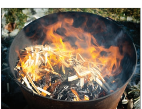
Palm branches are rapidly diminished to ashes outside of St. Bartholomew Church in Columbus, on March 4. Parish leaders involve children in their ash-making process to help them understand the meaning of Lent.

Staff members estimate that they have made their own ashes for at least two