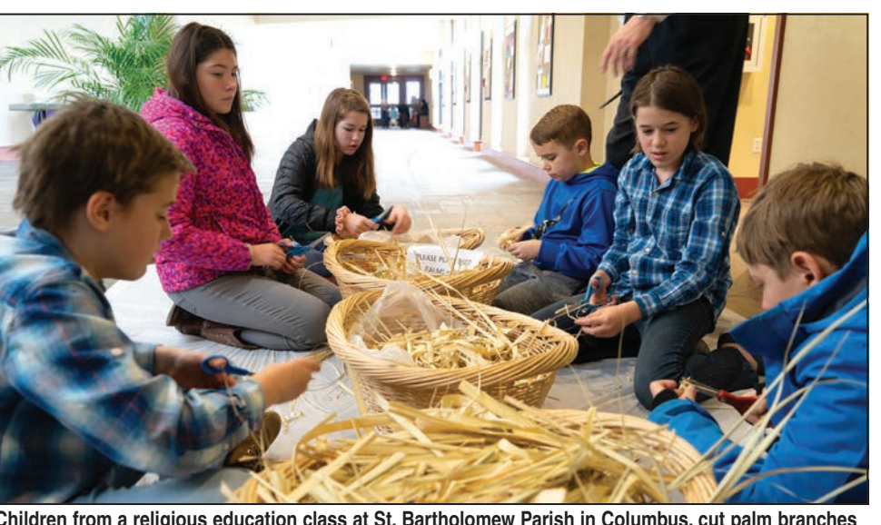
Children from a religious education class at St. Bartholomew Parish in Columbus, cut palm branches into smaller pieces more convenient for burning at the church on March 3. Church leaders involve children in their ash-making process to help them better understand Ash Wednesday.