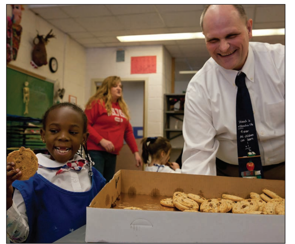
Traditional Lenten practice generally involves sacrifice or foregoing earthly pleasures, like cookies, chocolate or other sweets.