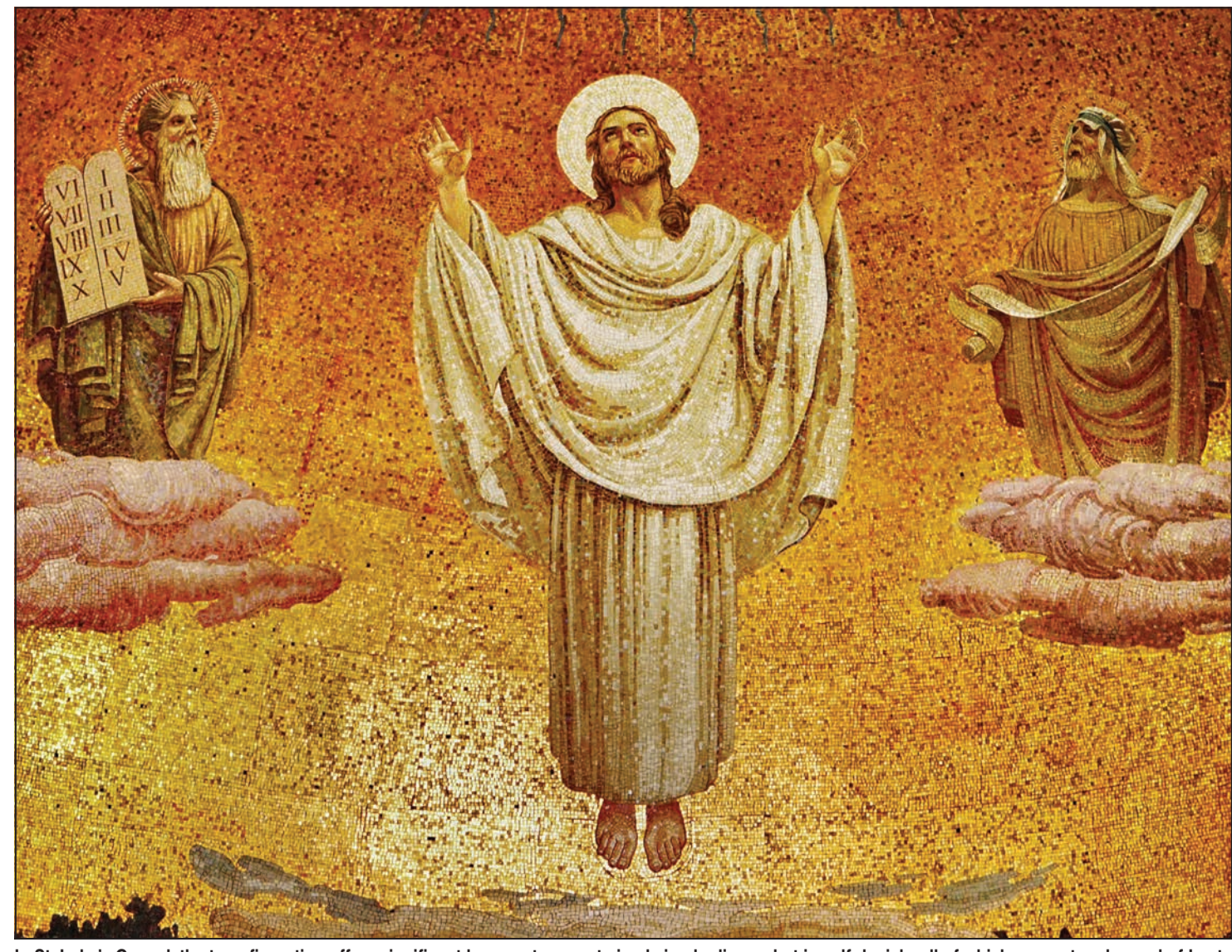
In St. Luke's Gospel, the transfiguration offers significant lessons to us not simply in obedience, but in self-denial—all of which are part and parcel of Lent, the season in which we are called to allow ourselves to be transfigured by grace into new creations of God.

It is not sinful, for example, to enjoy chocolate (a frequently forsaken "pleasure" during Lent). But indulging ourselves in chocolate? Hoarding it? Sneaking it into our mouths when (we