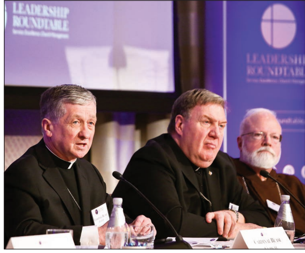
Chicago Cardinal Blase J. Cupich, left, speaks during a Feb. 1 panel discussion at the Leadership Roundtable's Catholic Partnership Summit in Washington to put forth possible solutions to the church's sex abuse crisis. He is joined at the table by Cardinal Joseph W. Tobin of Newark, N.J., center, and Boston Cardinal Sean P. O'Malley.

Explore different models of training for new bishops; develop a mentoring system for bishops; rethink models of seminary formation to address disparities between institutions; revise the theology of priesthood and priestly identity to reflect servant leadership; revise the Plan for Priestly Formation and seminary curriculum to address the root causes of clericalism by equipping priests with skills in shared leadership, transparency and accountability; and commit to and convene truth and reconciliation commissions concerning sexual abuse and cover-up, locally or