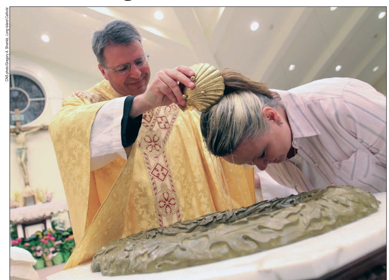
A priest baptizes a catechumen at St. Jude Church in Mastic Beach, N.Y. The bishops at the Second Vatican Council paved the way for the renewal of the ancient way of receiving adults into the Church, which is now called the Rite of Christian Initiation of Adults.

Over the course of a number of intense weeks of training, the recruit learns how to live as a member of the military. One doesn't just learn about the Army or the Marines; one becomes a soldier or a leatherneck. A similar transition takes place during the catechumenate. Seekers don't simply learn about the Catholic Church; they are transformed by