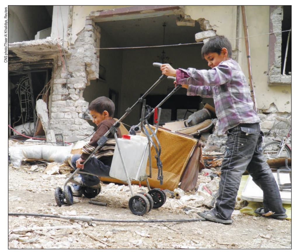
A boy pushes a stroller holding water and another child past destroyed buildings in the besieged area of Homs, Syria, on Feb. 2. Syrians fleeing to neighboring Jordan from Homs said some people there are starving to death for lack of food.

For some, the little food available consists of bulgur, a kind of cereal, and some olives, and people with access are making soup of bulgur and water. The priest said people eat a few olives as an