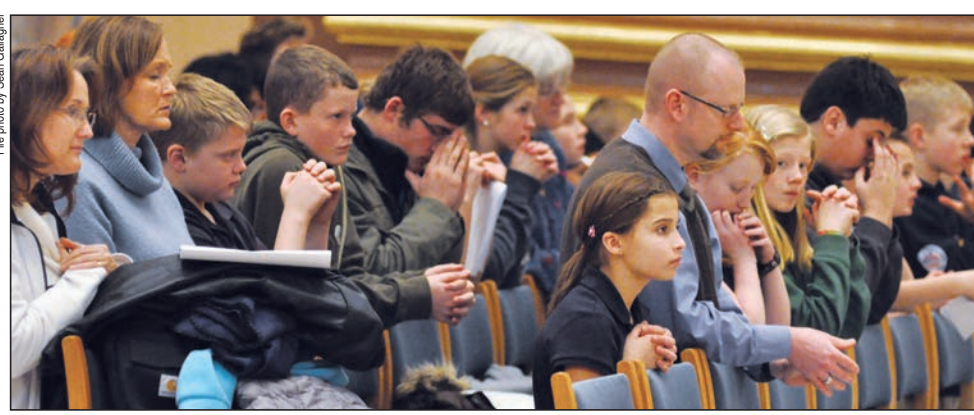
Students and teachers of Lumen Christi Catholic School in Indianapolis kneel in prayer during the Jan. 22 Mass at SS. Peter and Paul Cathedral that commemorated the 41st anniversary of the Roe v. Wade and Doe v. Bolton U.S. Supreme Court decisions that legalized abortion across the country. The Church in the U.S. now observes the date as the Day of Prayer for the Legal Protection of Unborn Children. The archdiocesan Office of Pro-Life and Family Life coordinates the Mass and local March for Life that follows the liturgy.

"You're inviting parishioners to spiritually adopt a child who is in danger of