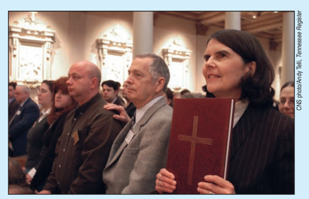
Those preparing to enter the Church through the Rite of Christian Initiation of Adults participate in the annual Rite of Election and the Call to Continuing Conversion at the Cathedral of the Incarnation in Nashville, Tenn.

As a priest, I have seen the exuberance of those working with what we know as the Rite of Christian Initiation of Adults (RCIA), and I've seen the grateful