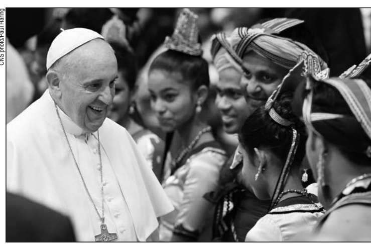
Pope Francis greets Sri Lankan dancers after a Mass for Sri Lankan pilgrims in St. Peter's Basilica at the Vatican on Feb. 8. The pope arrived after Mass and greeted an estimated 12,000 Sri Lankans living in Italy who were in