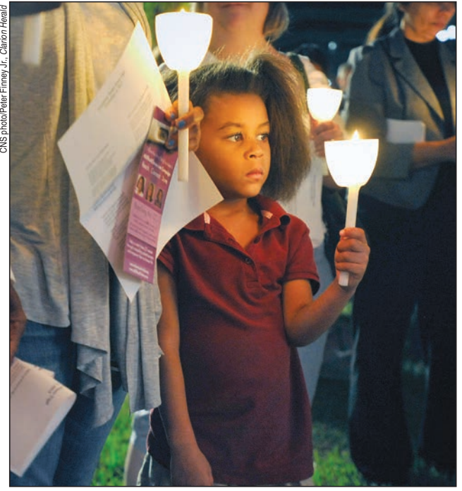
A young girl holds a candle during a prayer service last November on a lot near the proposed Planned Parenthood abortion center in New Orleans. New Orleans Archbishop Gregory M. Aymond has cautioned local Catholics and businesses they would be "cooperating with the evil that will take place" at the center if they participated in its preparation or construction.

Archbishop Aymond asked Catholics to pray "for those