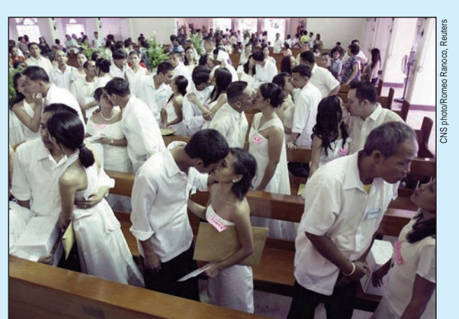
Newly married couples kiss during a mass wedding ceremony at a Catholic church in Manila, Philippines, in 2009. The fulfillment of goals for each spouse can help the unity of their marriage grow stronger.

Today, we recognize that both partners also remain individuals who grow and change, and have their likes and dislikes, interests and hobbies, and, more and