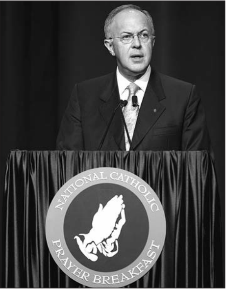
Carl Anderson, supreme knight of the Knights of Columbus, discusses threats to religious liberty on April 19 during the eighth annual National Catholic Prayer Breakfast in Washington.

"What is at stake here," Archbishop Chullikatt said, "is the future of humanity itself." He added freedom of religion is "not only a moral but also a