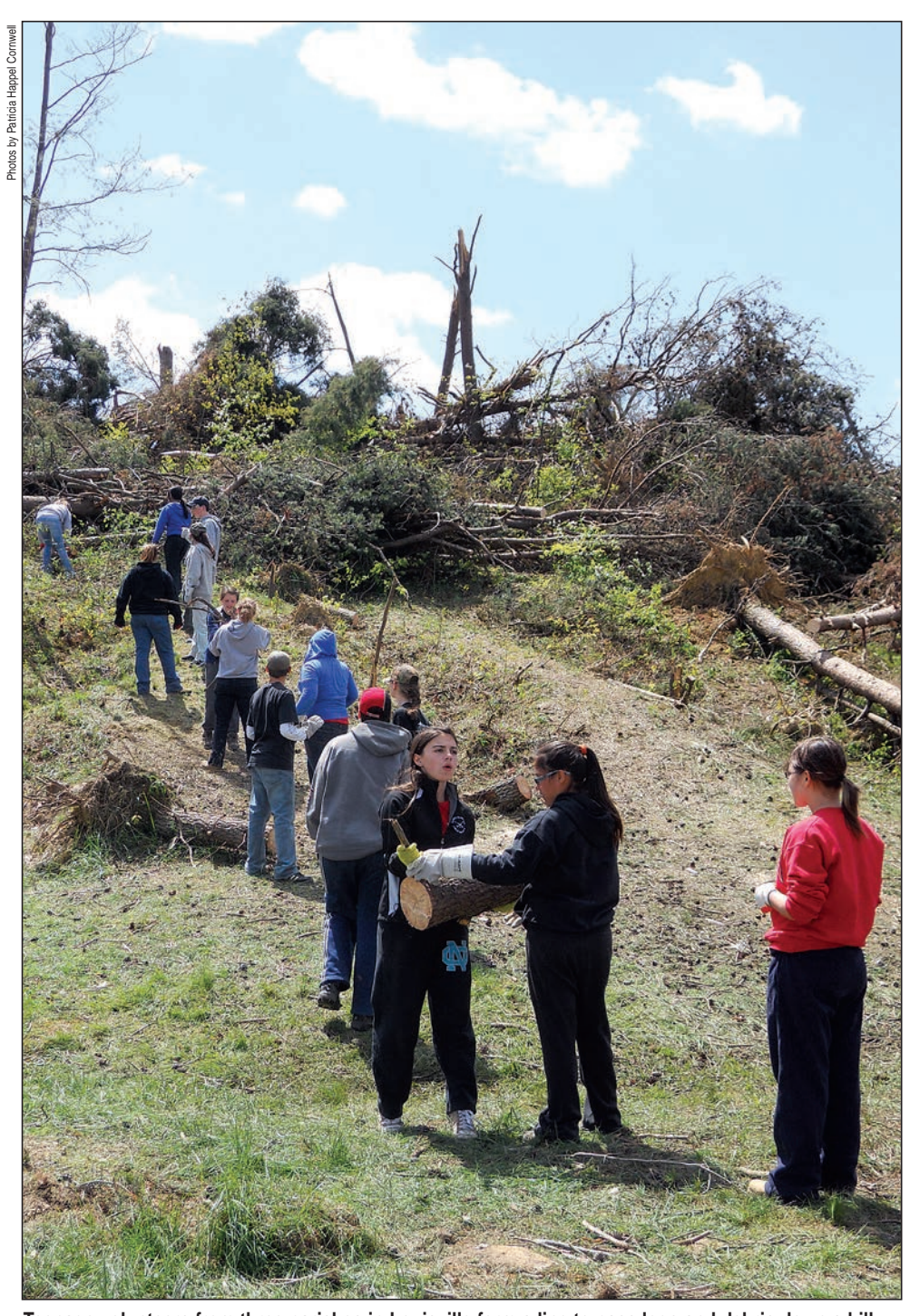
Teenage volunteers from three parishes in Louisville form a line to pass logs and debris down a hill they are helping to clear for a family near Henryville on April 11. A barn and seven acres of trees were destroyed, and two houses on the property were partially damaged by one of the March 2 tornadoes.

On April 13, the youths cleaned up debris in the cemetery that serves St. Francis Xavier Parish and St. Michael Parish in Charlestown. At the end of the