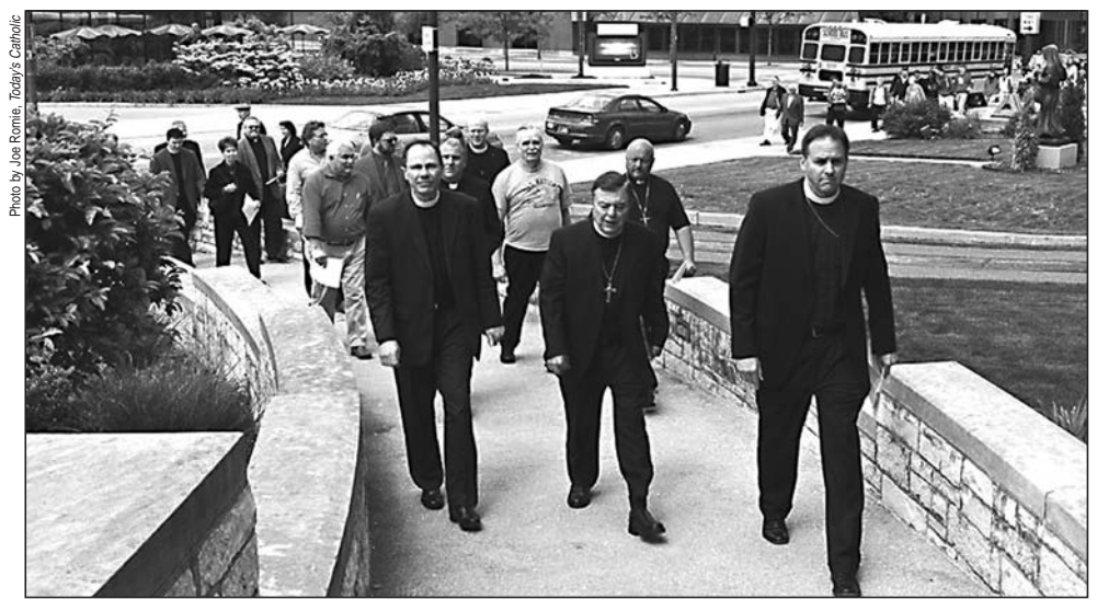
Lutheran Church-Missouri Synod leaders and members of their congregations walk to the Cathedral of the Immaculate Conception in Fort Wayne, Ind., in the Diocese of Fort Wayne-South Bend on April 17 to express their solidarity with Catholics concerning the defense of religious liberty.