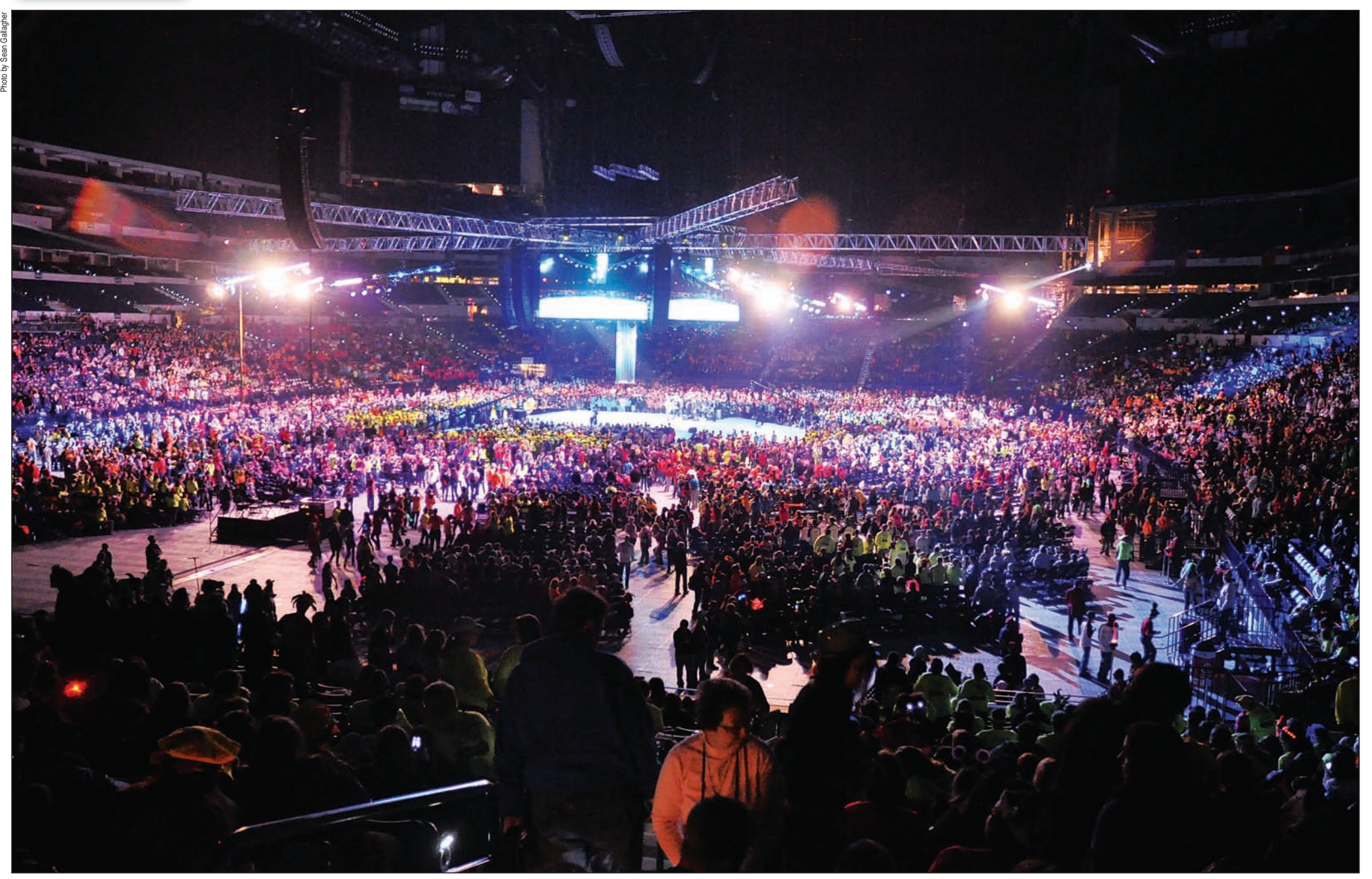
Above, with multicolored lights flashing, 23,000 National Catholic Youth Conference participants fill the floor and lower seats of Lucas Oil Stadium on Nov. 18 at the start of the conference's Friday night general session.

Youths live out their faith at National Catholic Youth Conference