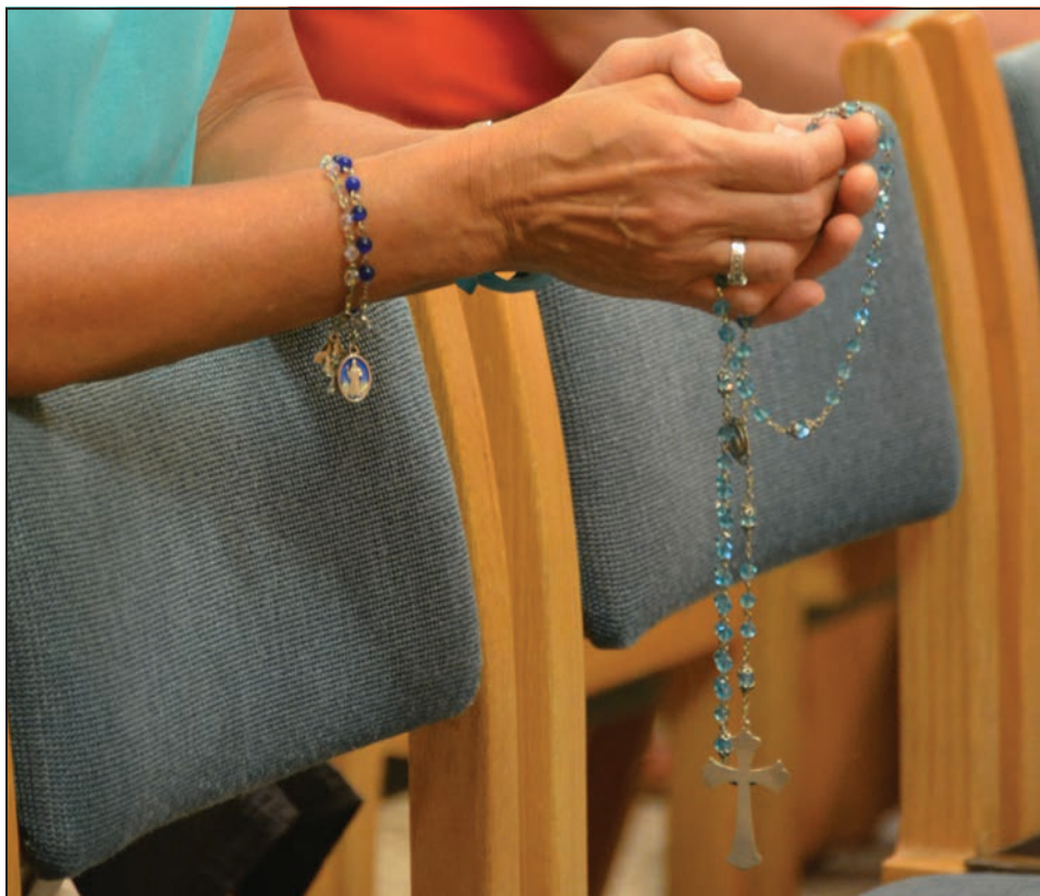
People pray on Sept. 15 in SS. Peter and Paul Cathedral in Indianapolis during a “Holy Hour for Prayer, Penance and Healing” for victims of sexual abuse. Three parishes in the Indianapolis North Deanery held listening sessions or a similar holy hour in response to the current clergy sexual abuse crisis.