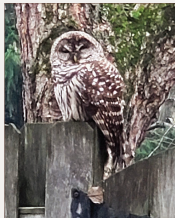
A barred owl perches on a fence in Indianapolis on Nov. 25.