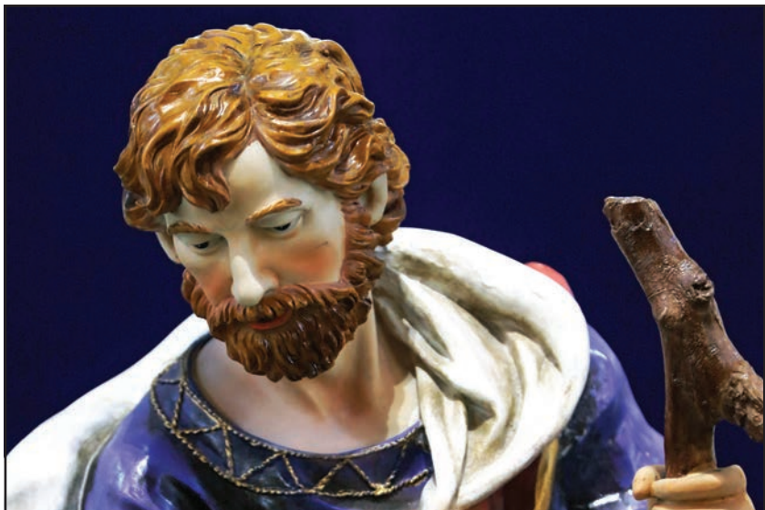
A statue of St. Joseph is pictured at Jesus the Divine Word Church in Huntington, Md., on Dec. 5.