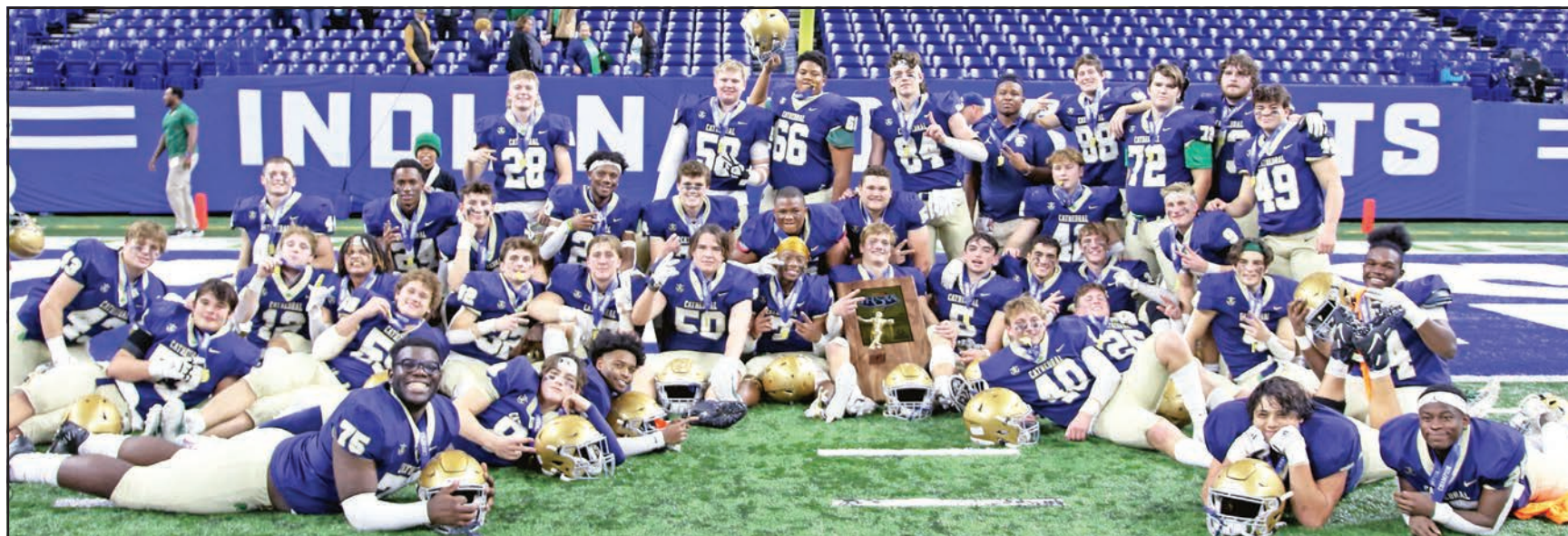
The seniors on the football team of Cathedral High School in Indianapolis share the joy after their squad won the Indiana High School Athletic Association's Class 5A state championship on Nov. 26 at Lucas Oil Stadium in Indianapolis.

"This will be a group, 30 years from now, where they'll all come back for reunions because they'll want to see each other. That's how they are. They are a very special group." †