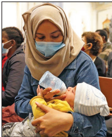
A woman wearing a protective mask feeds her baby as she waits for Pope Francis to arrive for an ecumenical prayer with migrants in the Church of the Holy Cross in Nicosia, Cyprus, on Dec. 3.

In other words, he does not expect people to look at migration with rose-colored glasses, but he does expect them