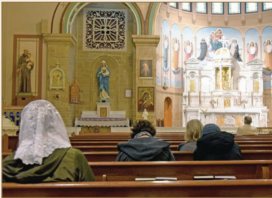
People pray during eucharistic adoration at Our Lady of the Most Holy Rosary Church in Indianapolis on the morning of Dec. 1, the day the U.S. Supreme Court heard oral arguments in Dobbs v. Jackson Women's Health Organization, an appeal to overturn Mississippi's ban on most abortions after 15 weeks of pregnancy.