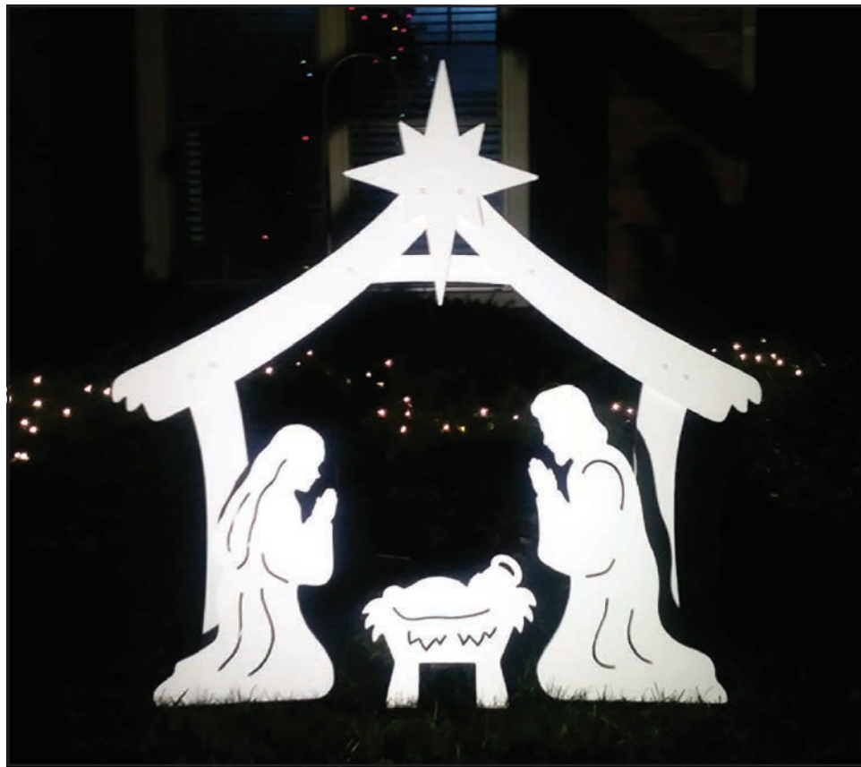
A light illuminates a Nativity scene on a December night in Fishers, Ind., in the Lafayette Diocese.

“I know people are really excited about having the Nativity scene,” says