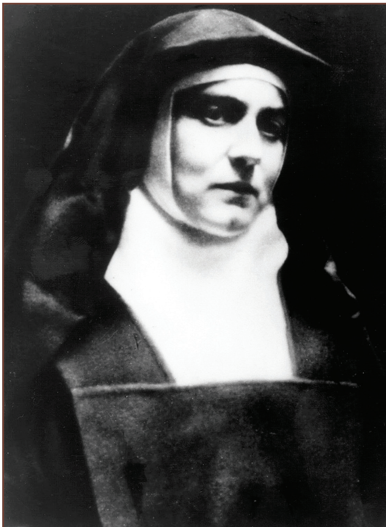
St. Teresa Benedicta of the Cross, whose name before entering religious life was Edith Stein, is pictured in an undated photo. St. Teresa converted from Judaism to Catholicism in the course of her work as a philosopher, and later entered the Carmelite order. She died in the Nazi concentration camp at Auschwitz in 1942.