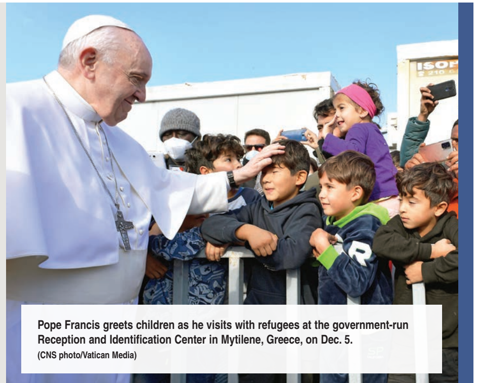
Pope Francis greets children as he visits with refugees at the government-run Reception and Identification Center in Mytilene, Greece, on Dec. 5.