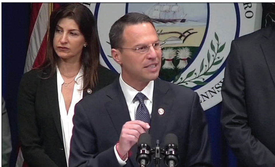
In a screen grab taken from video, Pennsylvania Attorney General Josh Shapiro speaks during an Aug. 14 news conference to release a grand jury report on a months-long investigation into abuse claims spanning a 70-year period in the dioceses of Harrisburg, Pittsburgh, Scranton, Allentown, Greensburg and Erie.

“In response, five of the bishops submitted statements to us, and the sixth, the bishop of Erie, appeared before us in person. His testimony impressed us as forthright and heartfelt,” they wrote. “It appears that the Church is now advising law enforcement of abuse reports more promptly. Internal review processes have