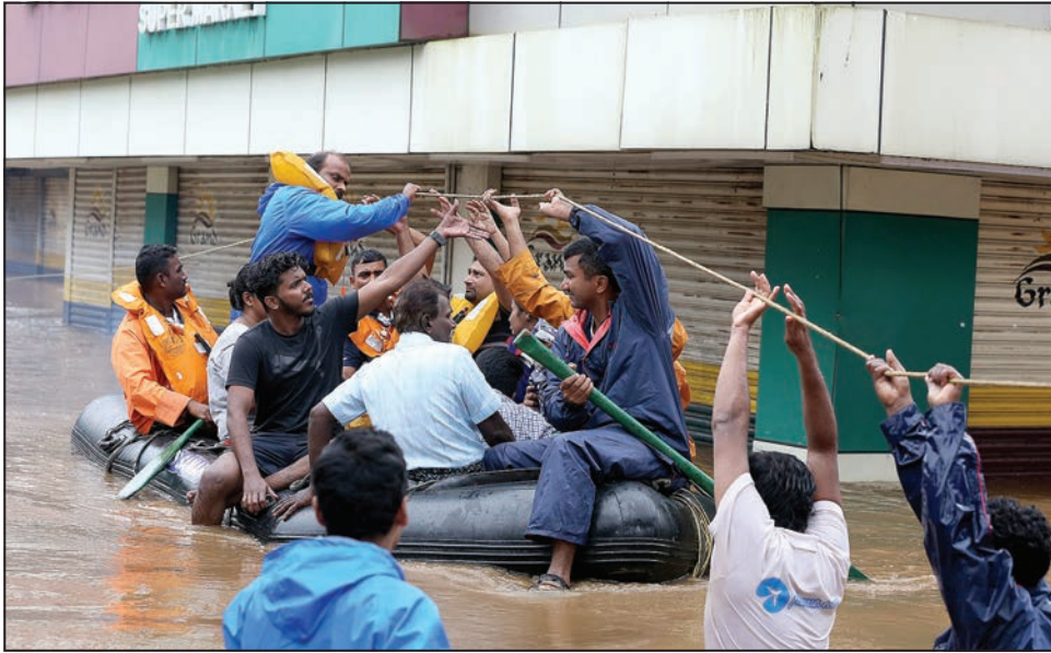
Rescue workers evacuate people from flooded areas on Aug. 16 after the opening of a dam following heavy rains on the outskirts of Cochin, India. The Catholic Church has joined relief efforts as unprecedented floods and landslides continue to wreak havoc in India's Kerala state, killing at least 75 people within a week.