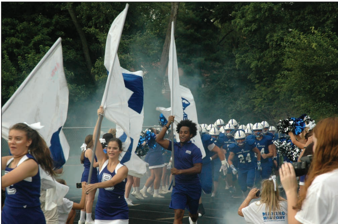
Cheerleaders from Bishop Chatard High School in Indianapolis lead their school's football team onto the field on Aug. 17 for the first true "home" game in the school's 55 years of playing the sport.

"It gets our alumni back on campus. Four of our five