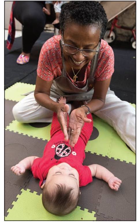
A woman plays with a child in 2016 at a maternity home in Riverside, N.J., one of six pro-life maternity homes in the Good Counsel network. Good Counsel also has four in New York state and one in Alabama and works with other homes all over the country. The Riverside facility houses about a dozen expectant mothers, provides a safe environment for the women to continue their pregnancy, and offers continuing education, job training and material support.

love in the world for another baby? Where there’s love, there’s life, and where there’s life, there’s hope. We can change things by looking at one life at a time and one family at a time.”