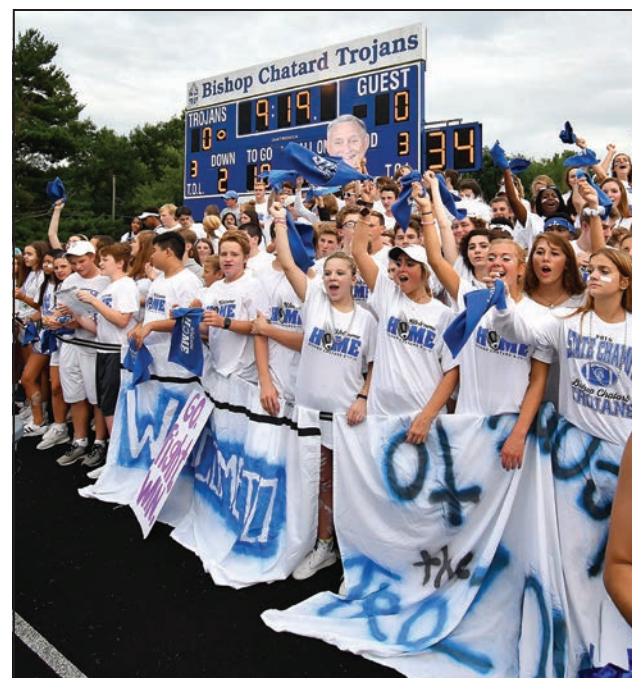
Students at Bishop Chatard High School in Indianapolis cheer on their Trojan football team on Aug. 17, the night of the first true "home" football game at the school—a 38-7 win over the team from Brebeuf Jesuit Preparatory School in Indianapolis.

"I would like to thank all the people who were part of the school from the beginning who created the history we have that allows us to do the things we are doing today. It truly is a culmination of 57 years of support and contribution from a lot of people." †