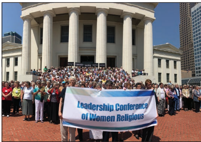
Approximately 800 women religious attending the Leadership Conference of Women Religious annual assembly gather on Aug. 10 on the steps of the Old Courthouse in downtown St. Louis. Earlier, as part of their 2018 annual assembly, they reaffirmed a 2016 LCWR resolution against racism. The Old Courthouse was the site of the first two trials in the Dred Scott case.

"Recent events in our nation, including the rise of white supremacy, growing nationalism and xenophobia, and our own failure to deal effectively with persistent systemic racism have heightened our concern and our desire to address racism