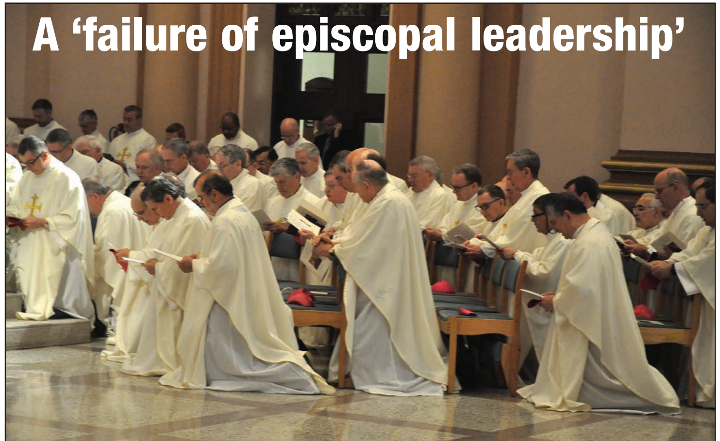
Bishops kneel while praying for victims of clergy sexual abuse during Mass on June 14, 2017, at SS. Peter and Paul Cathedral in Indianapolis during the U.S. Conference of Catholic Bishops' annual spring assembly. Cardinal Daniel N. DiNardo, president of the U.S. Conference of Catholic Bishops, has announced a comprehensive plan to address the new abuse scandal that has hit the Church in the United States.