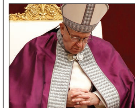
Pope Francis prays as he leads a Lenten penance service in early March in St. Peter's Basilica at the Vatican. "No effort must be spared" to prevent future cases of clerical sexual abuse and "to prevent the possibility of their being covered up," Pope Francis said in an Aug. 20 letter addressed "to the people of God."

VATICAN CITY (CNS)—"No effort must be spared" to prevent future cases of clerical sexual abuse, and "to prevent the possibility of their being covered up," Pope Francis said in a letter addressed "to the people of God."