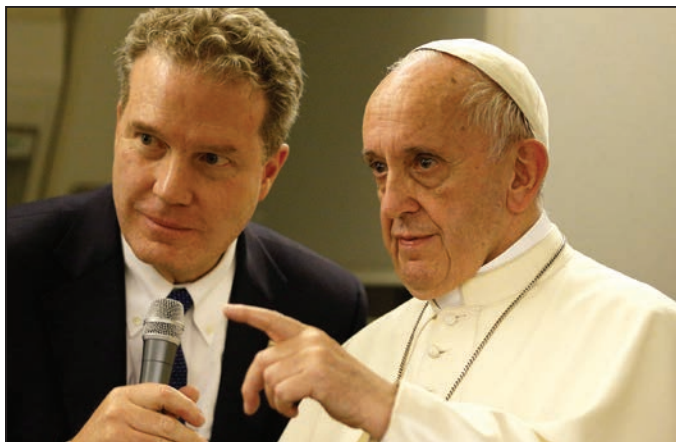
Greg Burke, Vatican spokesman, is seen with Pope Francis aboard the flight from Dhaka, Bangladesh, to Rome on Dec. 2, 2017. In an Aug. 20 letter "to the people of God," the pope said "no effort must be spared" to prevent future cases of clerical sexual abuse, and "to prevent the possibility of their being covered up."